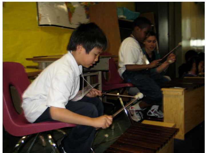
Students in the Nature of Music Program at El Dorado Elementary

This program demonstrates, documents and disseminates how music raises test scores and school attendance, offering a way to work in difficult schools where traditional teaching has failed. Thus, El Dorado, a great success!