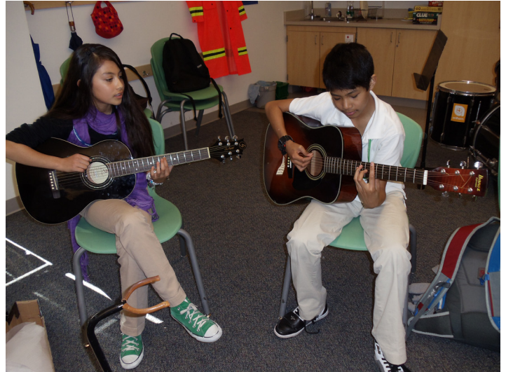
Students in the Making Waves program play on instruments donated through Music in Schools Today

We also donated three guitars to Hillside Elementary School to assist with their guitar class, taught through a collaboration between Hillside Elementary and MUST.