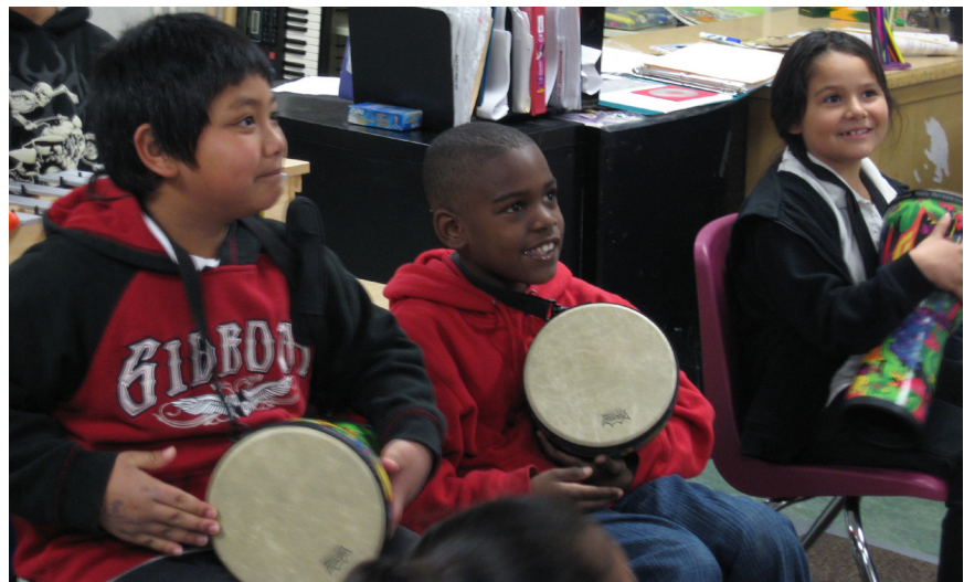
Students in the Exploring Music Program at El Dorado Elementary

5th Annual MUST Golf Tournament Hosted by Tré Cool